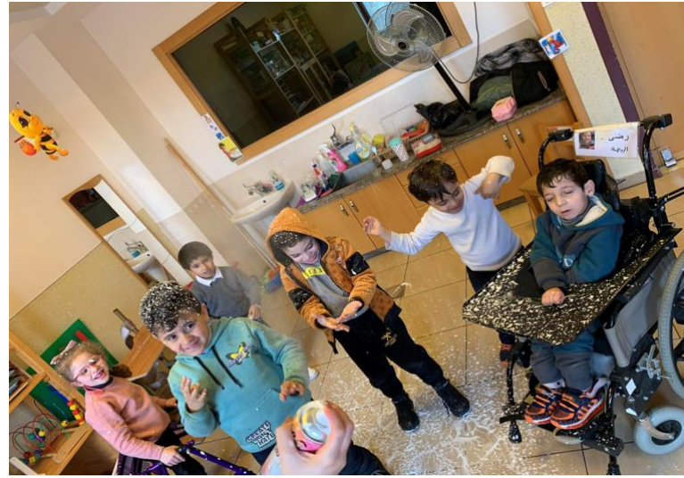
Winter at Lifegate