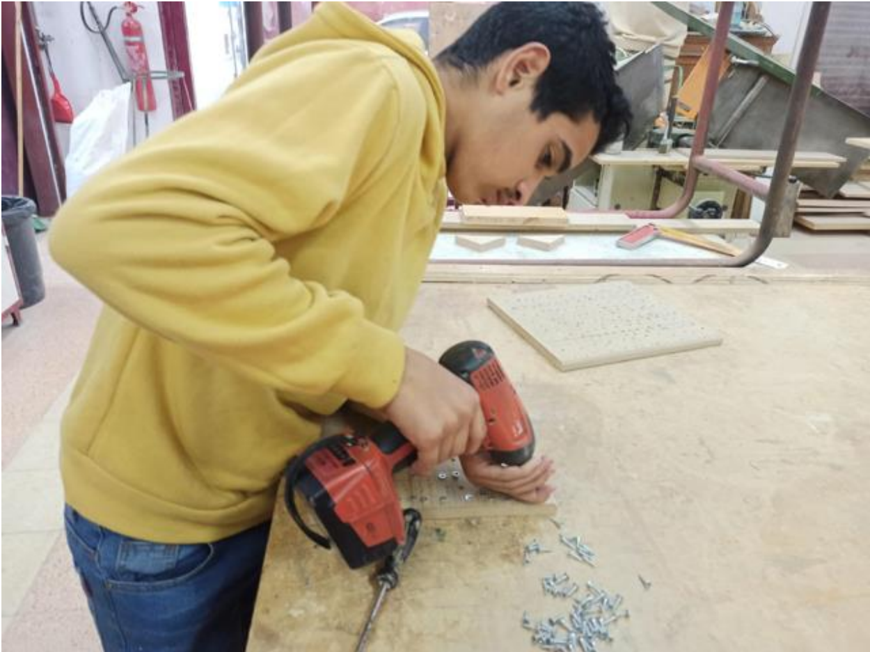
...first experience with a cordless screwdriver...

In our textile departments, we sew shopping bags from fabric remnants and give them out to people with our bread, thereby contributing to environmental protection in our region and encouraging people to go shopping with their fabric bags. We are pleased with the positive feedback from the sale of gift items made at Lifegate in the USA and have already received a large repeat order for our embroidery department. Over 20 people with disabilities who have learned this craft with us, and are practicing it at home, can thus continue to be provided with work and wages by us. Our olive oil has already arrived in Germany and we are now packaging the thyme spice zatar, which is a very popular accompaniment to olive oil. We purchased it in the Qatar in Nablus (Shechem) because of the usual good quality and it is currently being packed in our workshops for transportation to Germany.