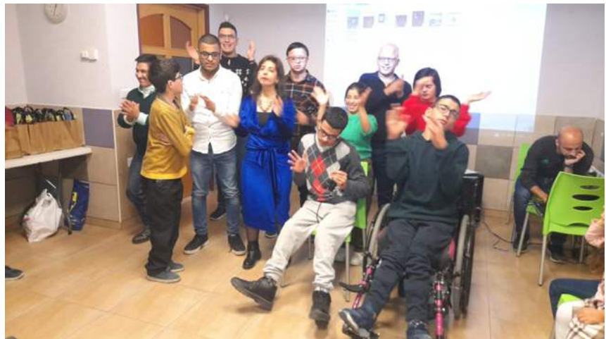
Contributions from our young people