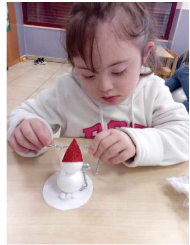
Christmas preparations at school with a tasty lunch