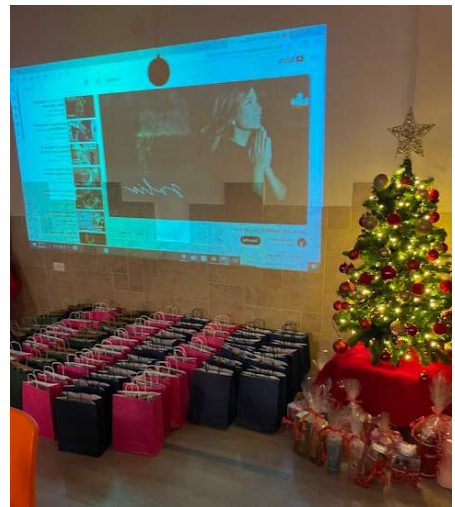
The gifts prepared by Suher were of course part of it