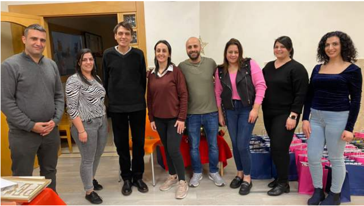
Team leaders who manage and are responsible for our work