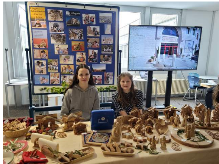
Pupils at the Bodensee School in Friedrichshafen (Lake Constance)