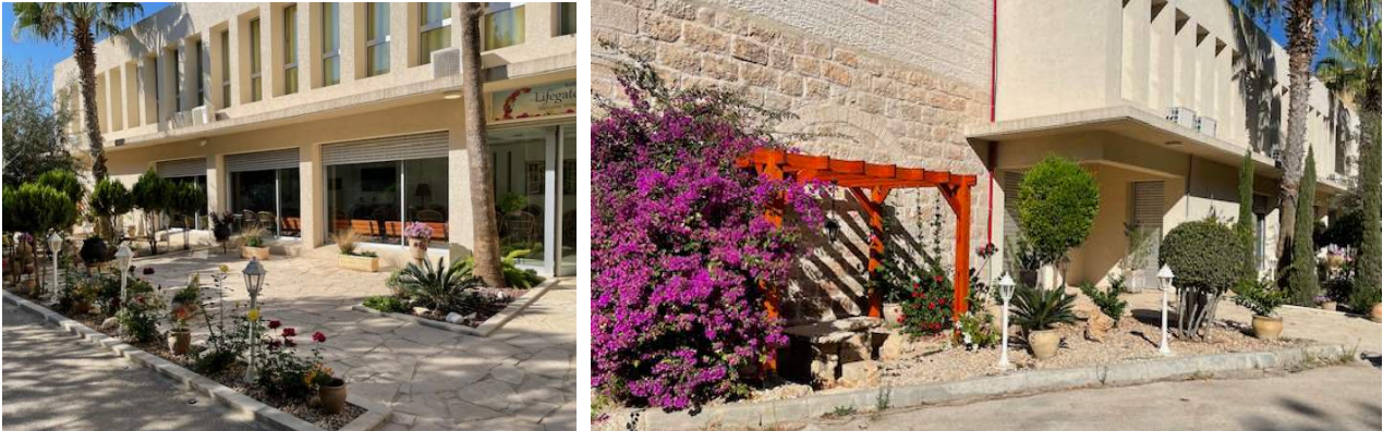
Lifegate Garden Guest House

The roses and bouganvilli bloom in our Lifegate Garden guest house and we are delighted to welcome local churches and organizations who book our rooms for day seminars. A small consolation for the otherwise absent foreign guests.