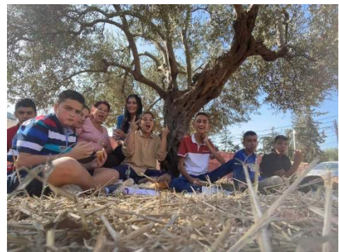
Children from the special school harvesting olives