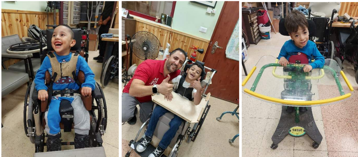
In the auxiliary workshop

The current security situation on our roads does not allow our service and repair vehicle to reach more distant places at the moment. That is why we are limiting ourselves to people from the towns and villages near us and helping local facilities where children and young people with disabilities live. We also provide our Lifegate children and children from the Caritas Baby Hospital with wheelchairs, walking aids and standing aids. If the security situation allows, our service will also reach other places in the West Bank. Our orthopaedic technology department is also currently paused, as German specialists have been recalled for safety reasons. Here, too, we hope to return soon and continue this important work.