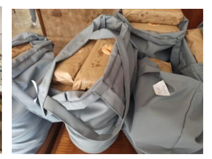
the bread is delivered to people in need in cloth bags sewn by us