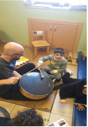
Psychomotor skills with instruments