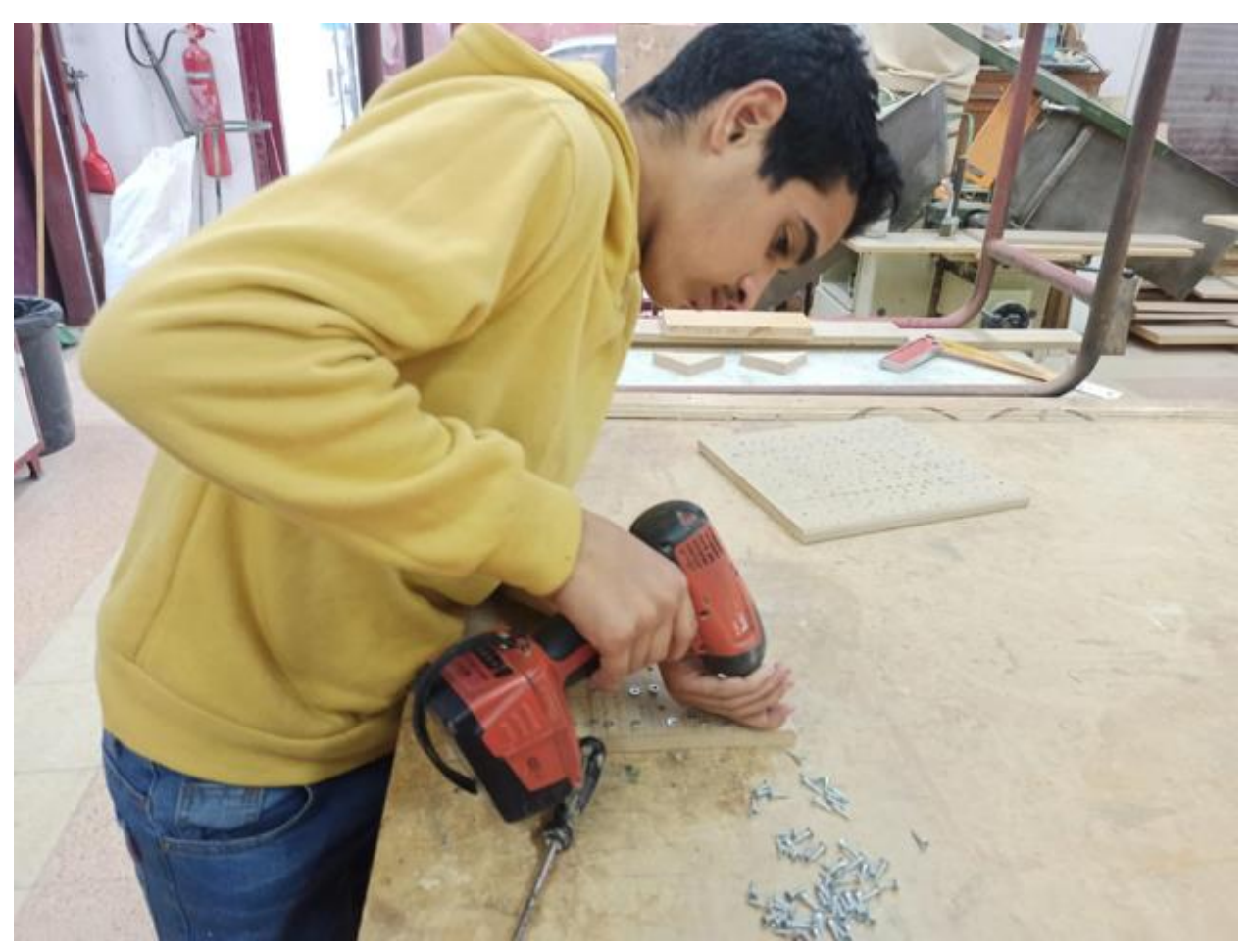
...first experience with a cordless screwdriver...

In our textile departments, we sew shopping bags from fabric remnants and give them out to people with our bread, thereby contributing to environmental protection in our region and encouraging people to go shopping with their fabric bags. We are pleased with the positive feedback from the sale of gift items made at Lifegate in the USA and have already received a large repeat order for our embroidery department. Over 20 people with disabilities who have learned this craft with us, and are practicing it at home, can thus continue to be provided with work and wages by us. Our olive oil has already arrived in Germany and we are now packaging the thyme spice zatar, which is a very popular accompaniment to olive oil. We purchased it in the Qatar in Nablus (Shechem) because of the usual good quality and it is currently being packed in our workshops for transportation to Germany.