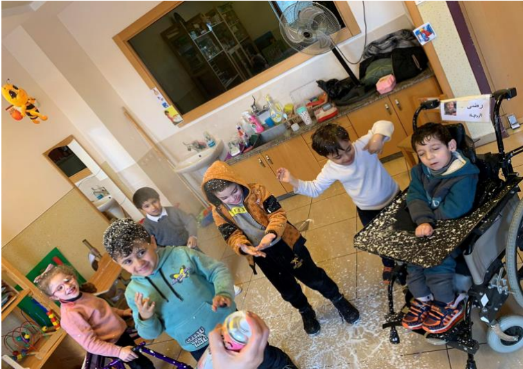
Winter at Lifegate