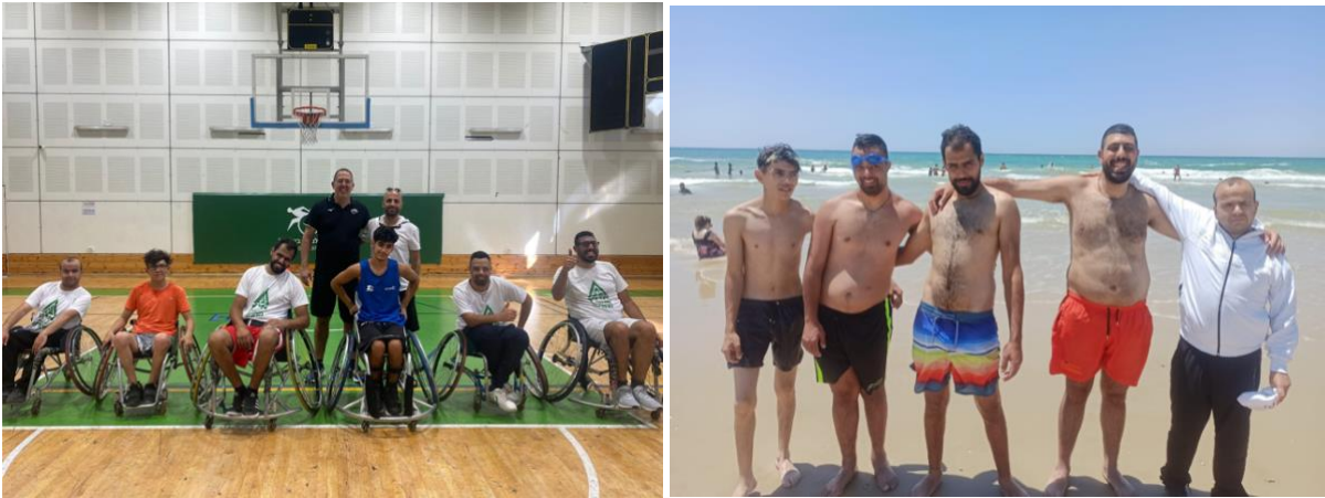
Wheelchair basketball with Israeli friends in Tel Aviv

Our wheelchair basketball team received a permit to meet our Israeli basketball friends (a permit from the Israeli authorities is required for Palestinians to go to Israel) and headed to Tel Aviv. The obligatory visit to the Mediterranean beach was also included and our team spent a happy, varied and fulfilling day "abroad"?